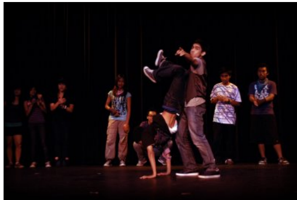
June 6, 2008 - RYC hip-hop performs at Asian Pacific Health Care Venture, Inc.'s annual Youth & Identity event.